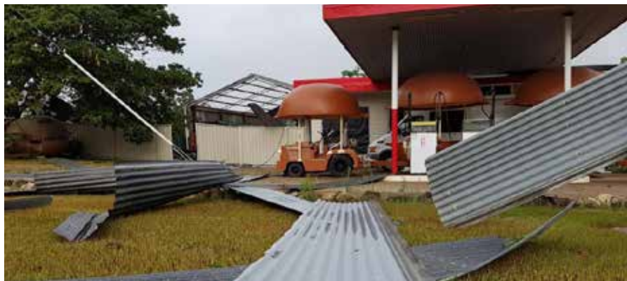
Above: The processing shed behind the Bauple Shop had it's roof blown off in a storm in November.