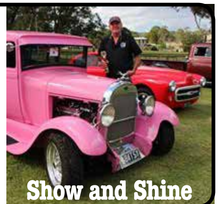
Show and Shine

All funds raised go to Local Charity SCOTS Contact Phil Strahan on 0428 722 457