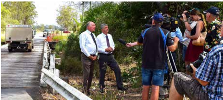
Above: Warren Truss (Acting Prime Minister, Minister for Infrastructure and Regional Development and Federal Member for Wide Bay) and Phil Truscott (Div 2 Councillor) are beset by the Media while announcing that the new Gutchy Creek Bridge is set to be completed in the next 12 months.