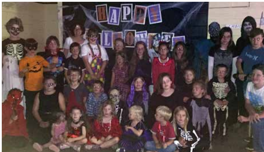
Above: Boo!!! Costumes and eerie eyes turn these little angels into some scary characters. The annual Halloween Disco at Gundiah Memorial Hall is always great fun for the little guys.

website at www.dss.gov.au/grants , or by email at vg2015@dss.gov.au or the Volunteer Grants 2015 Hotline on 1800 183 374. Applications close 2pm on Wed, 9 December 2015. Warren Truss MP