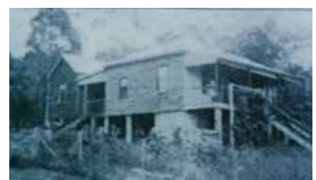
Left: Baker's Store. Top: Fredrick & Wilhelmina. Above: Home at Bakers Road, Bauple.