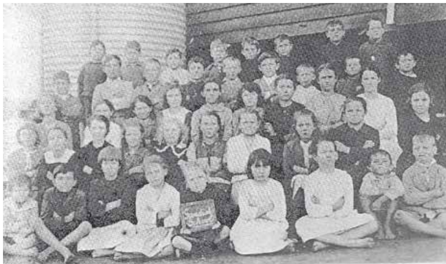
Pictured above are students of Gundiah School pre 1933. Date unknown. The building was located on land donated by Mr DCE Neilson at the old reserve on Tram Road, before being moved to its present location.

building on a 5 acre reserve south of the Gootchie railway station. Mr Palm donated a cottage which was moved to the site as a residence.