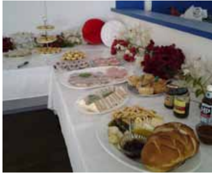
QCWA International Day brought out the best of British foods from the Midlands from pies with mushy peas to ploughman's lunches.

July Annual meetings are coming and the Gootchie members extend a welcome to any ladies interested in joining our Branch. Our meetings are