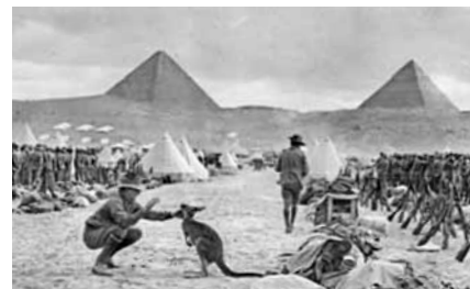
Above: Lines of the 9th and 10th Battalions at Mena Camp, Egypt, looking towards the Pyramids, December 1914. The soldier in the foreground is playing with a kangaroo, the regimental mascot.