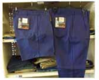
King Gee Work Wear Available Nash St