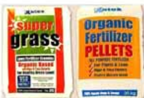
Kate's Organic Fertilizer Sprayer Available Both Stores