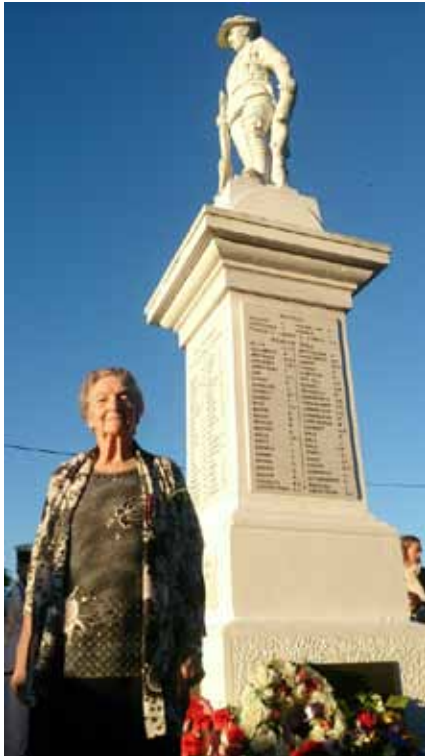
Top: A larger crowd attended the 100th Anniversary of WWI, Tiaro's Dawn Service.