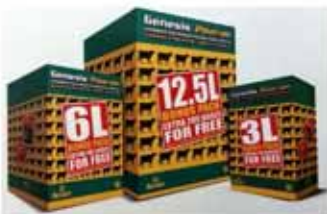
Genesis Pour-On 3L; 6L; 12.5L Bonus 40ml EziFire Applicator Available Both Stores