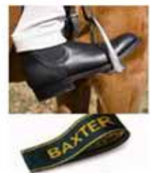
Baxter Boot • PC Approved Available Nash St