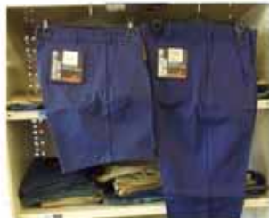
King Gee Work Wear Available Nash St