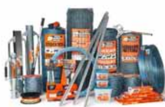
Fencing Materials Available Both Stores