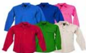
Male/Female Brumby Shirts Available Nash St