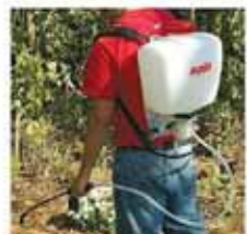
Solo 15L Backpack Includes 2 Year Warranty Available Both Stores