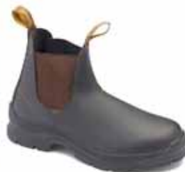
Blundstone 405 Work Boot Available Nash St