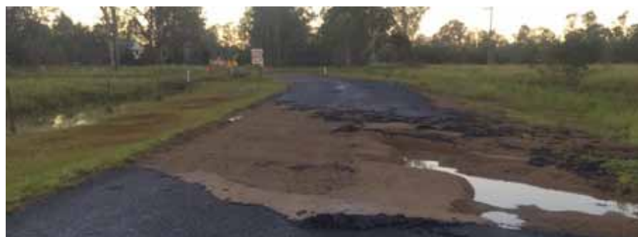
Above: Netherby Road was washed out between Gundiah and Gutchy Creek. Similar damage was done on Emorys Bridge Road at Gutchy Creek. Council was responsive and had temporary repairs complete by Sunday 22nd.