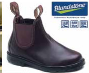
Blundstone Boots Available Both Stores

TOM GRADY - YOUR LOCAL C.R.T. BLOKE IN GYMPIE NASH STREET - PH 5482 1824 • TOZER STREET- PH 5482 1692