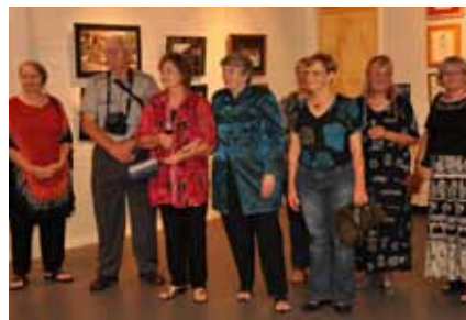
Above: Tiaro Creative Arts Group exhibited at Gatakers ArtSpace recently.