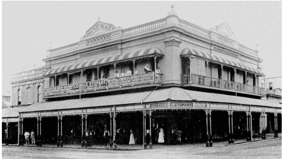
Above: Stupart & Young c.1900 on corner of Kent and Bazaar Street.