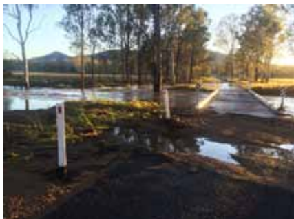
Above: Emorys Bridge Road washout at Gutchy.