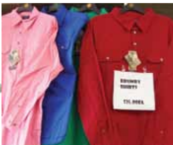
Brumby Shirts - $25 each Available Nash St