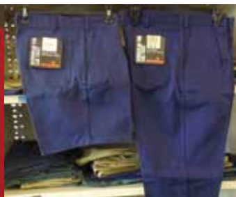
King Gee Work Wear Available Nash Street