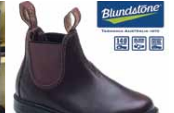
Blundstone Boots Available Both Stores