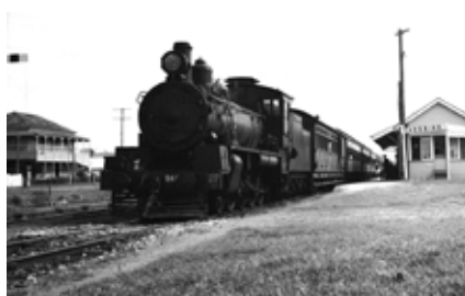
Above: Steam Train at Theebine Station c1967.

The Rail 150 historian provided some more info about train travel in our area: • Back in the day, passengers commonly changed trains at Theebine, both in day-time and in the middle of the night. • The junction, known as Kilkivan Junction, opened for traffic in 1884. A station building with a shelter shed, offices and goods shed were erected in 1885. Although the township nearby was named Coorindah, and altered to Theebine in 1895, the railway station retained the name Kilkivan Junction until 1910 when it was renamed Theebine.