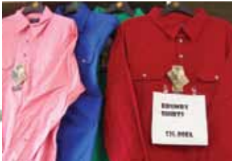
Brumby Shirts - $25 each Available Nash St