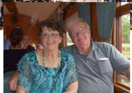
Top: The Rail 150 Steam Train ran through Gundiah again on Thursday 15 January on its way to Maryborough.