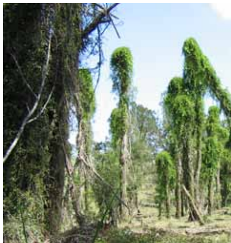
Above: Triffid like trees covered in Cat's Claw Creeper vine at Widgee. R: Madeira Vine flower