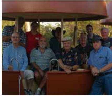
ABOVE: Fraser Coast Progress Associations say hi to Nosh the Nutmobile and ABC Radio..

dates will be confirmed end of year. We look forward to working with you in 2015 and we wish you all a Merry Christmas and gentle rain for the tanks! The BPA Committee