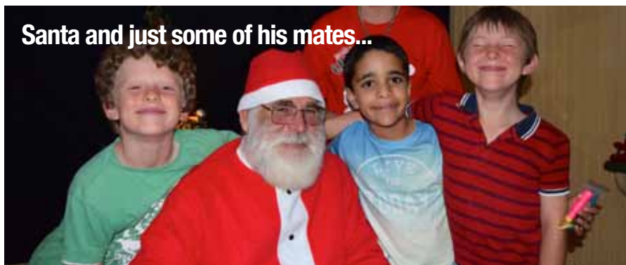
Santa and just some of his mates...

The program is for youth between ages of 12-17. We now have 10 cadet locations opened with 15 more cadet groups to open in the next 3 years. Current cadet locations include Childers & Biggenden. PCYC