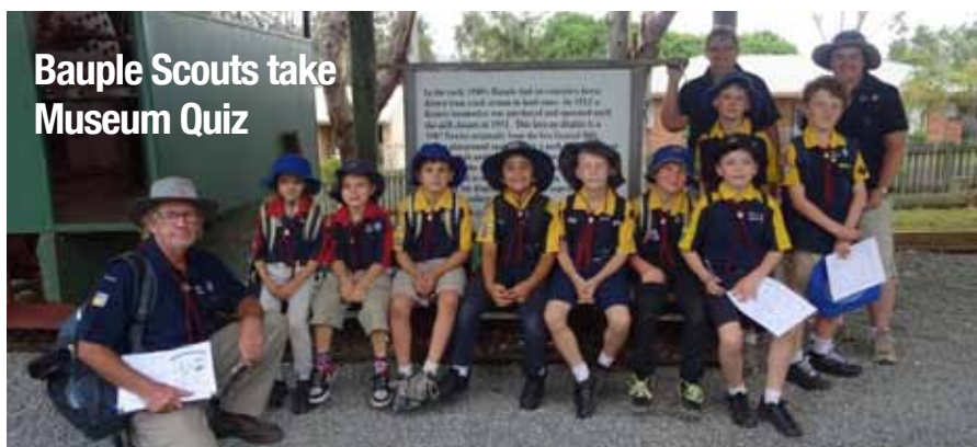
Bauple Scouts take Museum Quiz