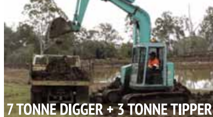
7 TONNE DIGGER + 3 TONNE TIPPER

DAMS • DRIVEWAYS • FENCE LINES SMALL CLEARINGS • HOUSE & SHED SITES • TRENCHING & LEVELING