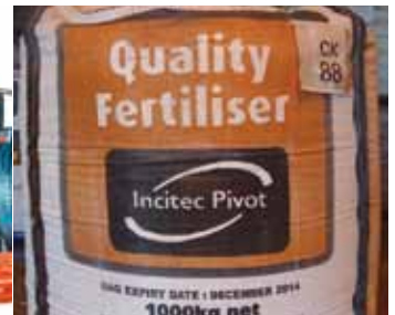
Incitec Pivot Fertilizer Available Tozer St