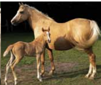
Prydes Horse Feed Available Both Stores