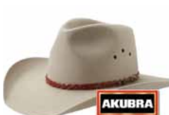
Akubra Hats - $130 each Available Nash St