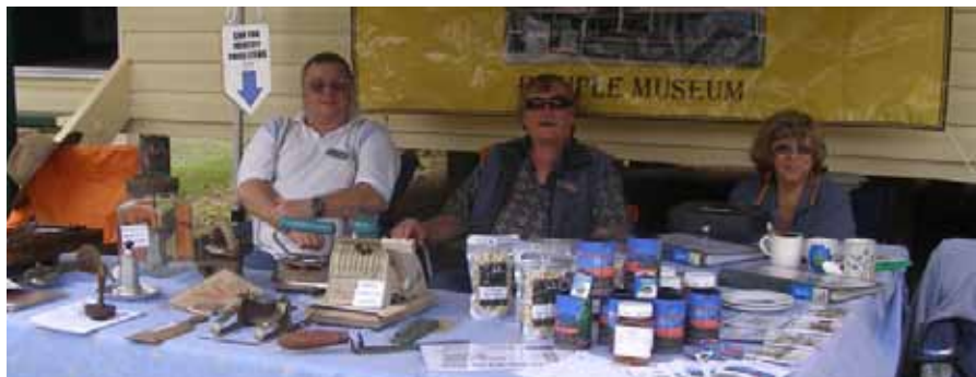
MT BAUPLE & DISTRICT HISTORICAL MUSEUM