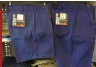
King Gee Work Wear Available Nash Street