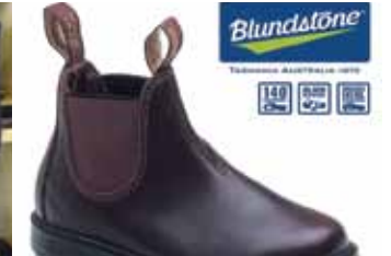
Blundstone Boots Available Both Stores

TOM GRADY - YOUR LOCAL C.R.T. BLOKE IN GYMPIE NASH STREET - PH 5482 1824 • TOZER STREET- PH 5482 1692