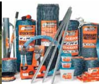
Fencing Materials Available both stores