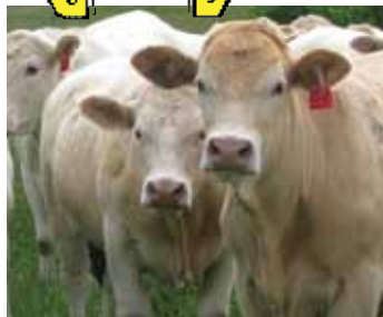
Pour-ons for cattle Available both stores