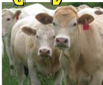
Pour-ons for cattle Available both stores