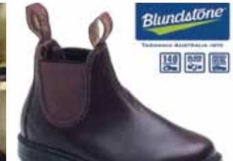
Blundstone Boots Available Both Stores

TOM GRADY - YOUR LOCAL C.R.T. BLOKE IN GYMPIE NASH STREET - PH 5482 1824 • TOZER STREET- PH 5482 1692