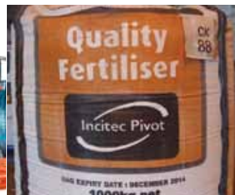
Incitec Pivot Fertilizer Available Tozer St