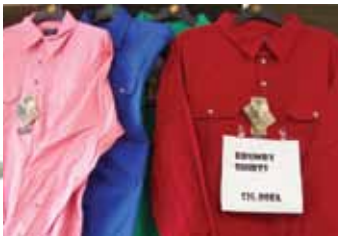
Brumby Shirts - $25 each Available Nash St