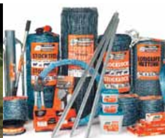
Fencing Materials Available both stores