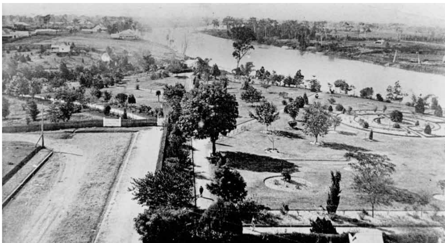
Above: Queens Park Maryborough 1879.