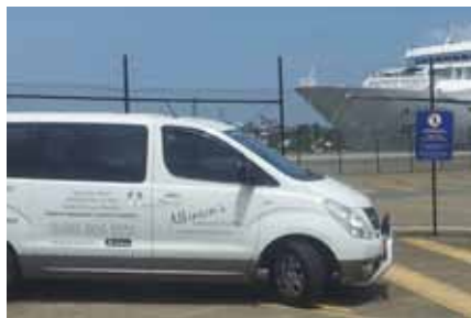
Above. Now travelling to the 'big-smoke' is more convenient for Fraser Coast residents.