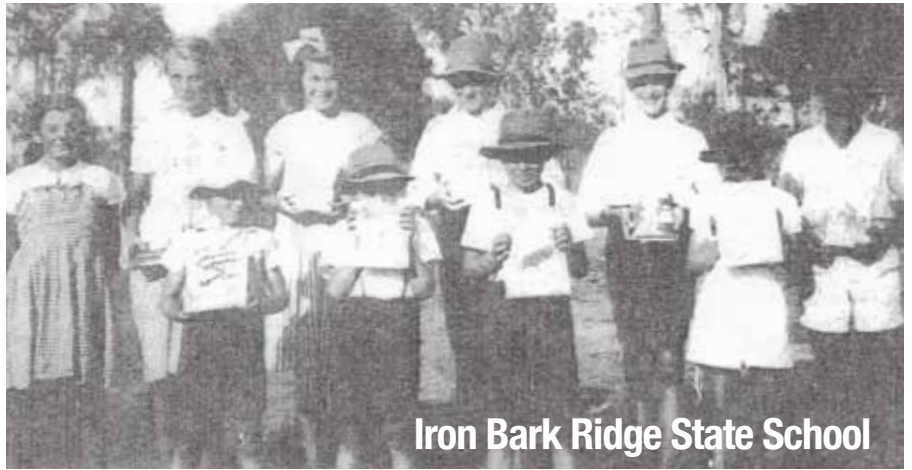
Iron Bark Ridge State School