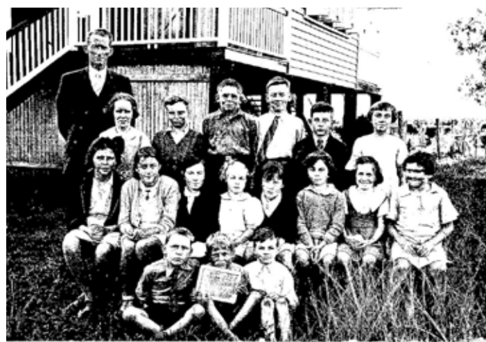
Rossendale State School - 1939