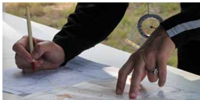
Long distance cross-country navigation was not lost in Bauple recently.