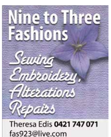
22 Price Street Tiaro