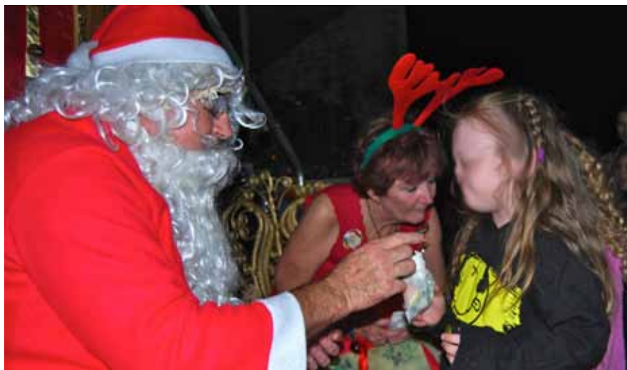
Above: Santa hands over the goodies to local children at the 45th Annual Lions Childrens Christmas Party held in Tiaro at the Recreation Grounds on the last Saturday in November.

Also festivefrasercoast.com.au for more events.