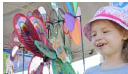
Above: Bauple Band Hall green hosts the Hinterland Markets every 4th Saturday, 7am-1pm.