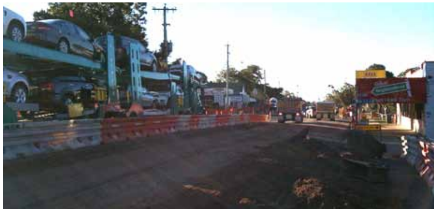
Bruce Highway roadwork in Tiaro commenced April 2012 and will continue until late October.