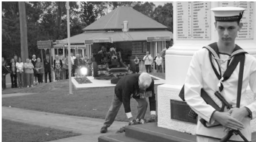
An estimated 300 members of the community attended the traditional Dawn Service in Tiaro.