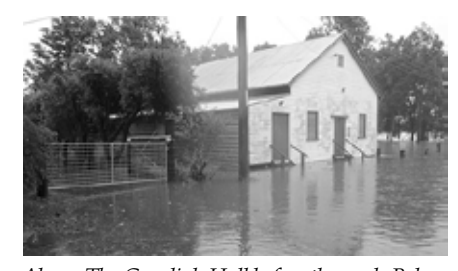
Above. The Gundiah Hall before the peak. Below, Netherby Road looking to Groundwater's home.