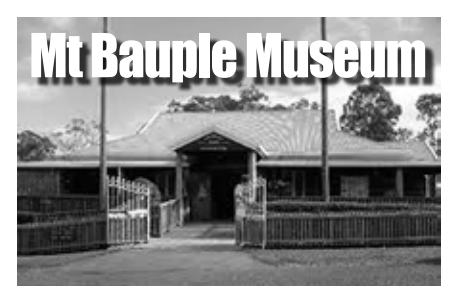
MOUNT BAUPLE & DISTRICT HISTORICAL SOCIETY