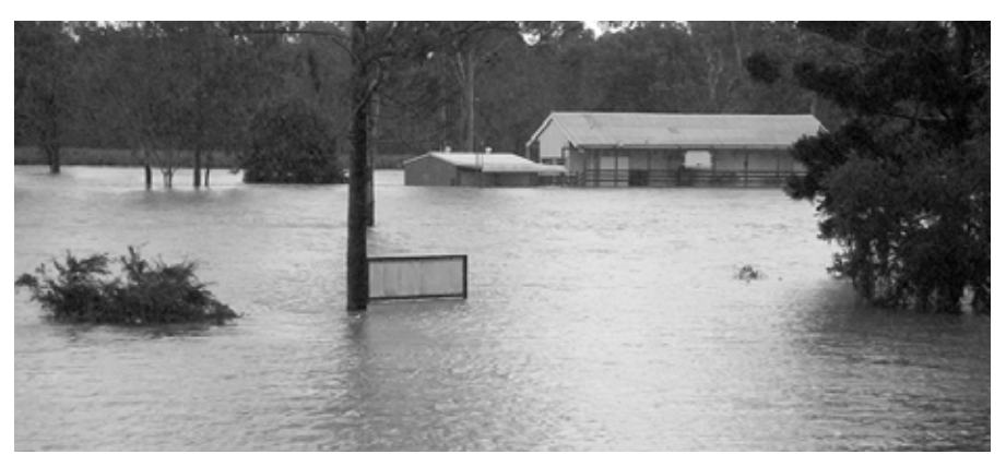
Water flows through Gundiah Community hall and shed while the GSS sign remains above water.