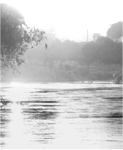
Recent flooding at Gutchy Creek, Gundiah (top) and Emery's Bridge, Gundiah (above).