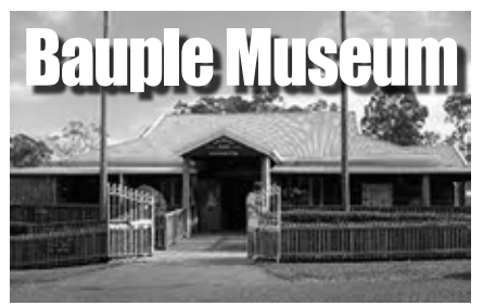
MOUNT BAUPLE & DISTRICT HISTORICAL SOCIETY