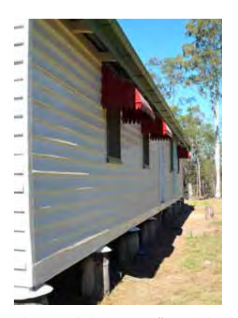
Above: It is looking more 'spiffy' every day. Munna Creek Hall will host a Music Festival in September and October. This will be a local event not to be missed.