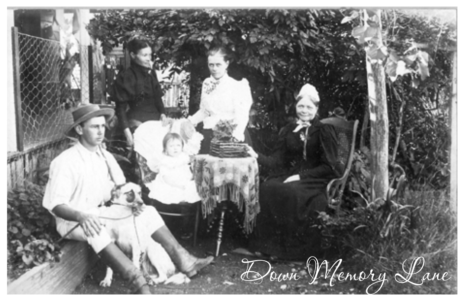
A photo from the Miva Homestead Collection.