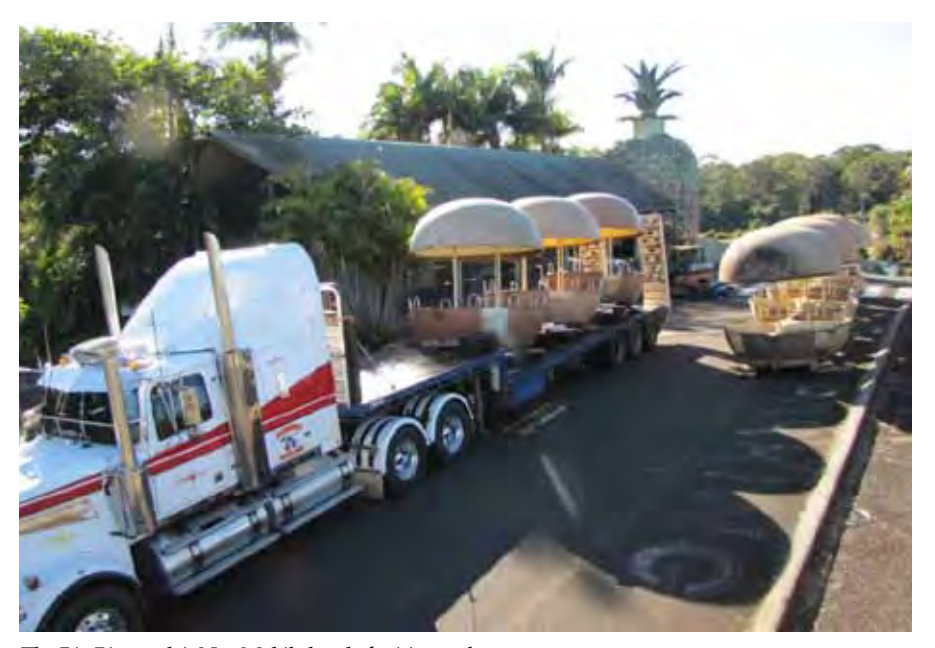
The Big Pineapple's Nut Mobile heads for it's new home.