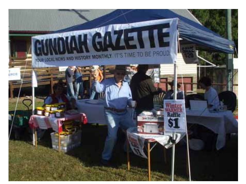
Gundiah Community Place and the Gundiah Gazette were just one of over 50 stalls, exhibitions and demonstrations at the Tiaro Farming & Lifestyle Field Day held in June. The Field Day is held every second year, with attendance this year around 1700. Well done Tiaro!