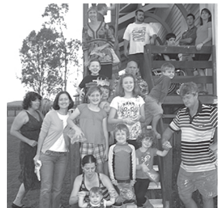
Big kids and little kids scrambled to find the eggs left behind by an absent-minded Easter Bunny at Gundiah Community Place on Easter Sunday. Games and a barbecue complemented the absolutely splendid weather.