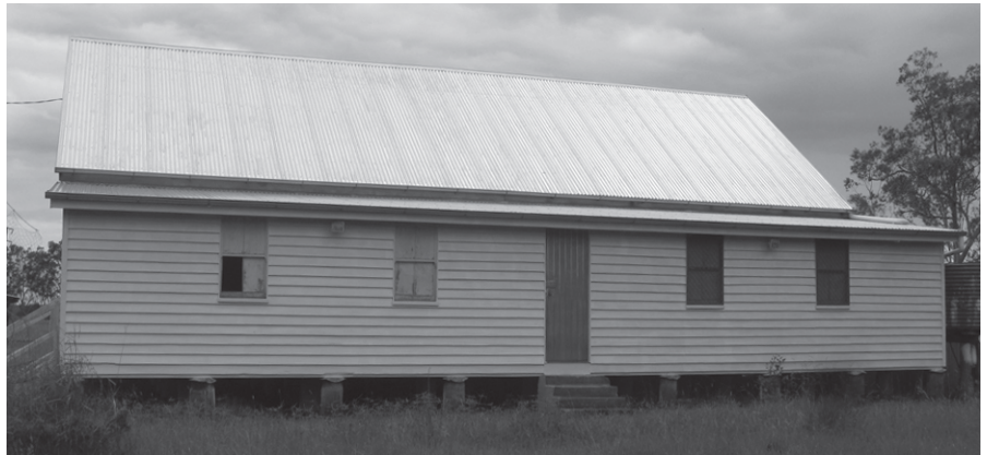
Above. View from the back of Munna Creek Hall. It has had some 'Tender Loving Care' from local families and the Fraser Coast Regional Council of late. They are warming up for an amazing social revival. Don't miss out!

STOP PRESS! CLEAN UP DAY FOR GUNDIAH SCHOOL IS SATURDAY MAY 7 AT 8.30AM. ALL WELCOME!