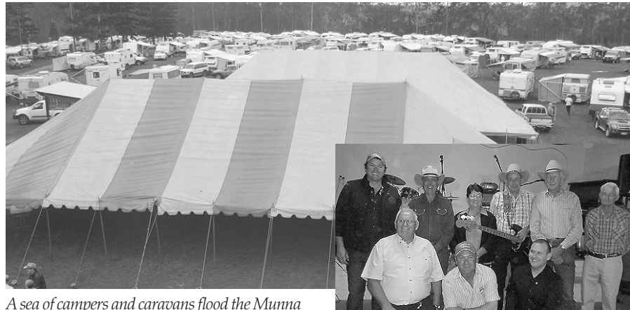
A sea of campers and caravans flood the Munna Creek Hall grounds for the inaugural Munna Creek Music Festival. Local music starts here...

The festival will definitely be cemented on the Fraser Coast calendar and you can follow what is happening on www. munnacreek.com thanks to the generosity of David Parker Web Designs.