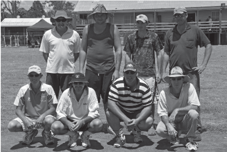
A motley crew: the Theebine Smashers, winners of the Australia Day Cricket Match, 2010.