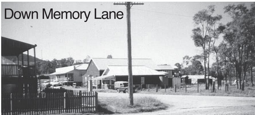
Brayshears Butcher Shop in Gundiah is pictured in front of the Hall 1957. The lot was subdivided from property granted by deed to Charles Scarrott, the original Hotel owner. It was transferred to at least 3 other parties before the Brayshears purchased it in 1937.