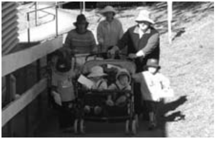
Carers on a recent excursion to the local shops in Tiaro.

Early childhood is an important stage in a child's education and learning. Church of Christ Care's Early Childhood Program promotes inquiring minds, a love of learning and supports children to become competent life long learners. In Family Day Care children learn