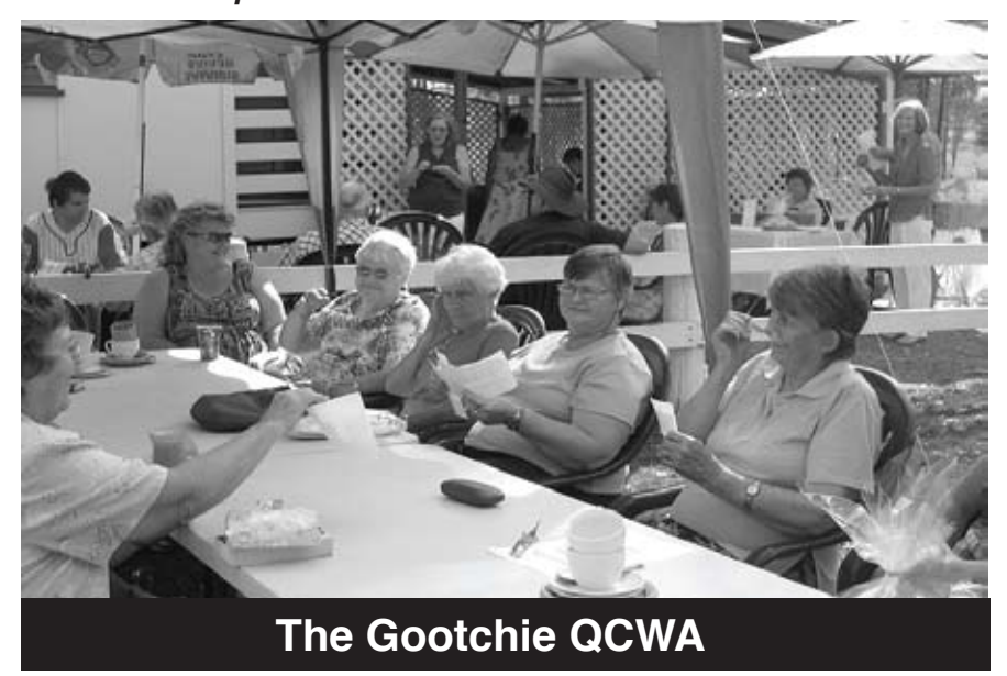
The locals enjoying the Annual Spring Fair at Gootchie QCWA Hall.

A round-up of local events & achievements: