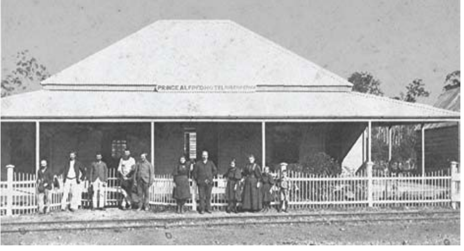
The second Prince Alfred Hotel (Halfway House), burned down in 1894. The present pub boasts the area's longest continuous liquor license since 1867.

19 Dec 2009. Q150-Horse drawn Cobb & Co Coach will take 1875 coach route from Kilkivan, via Gundiah Pub to Maryborough. FCSS 4123 5311.