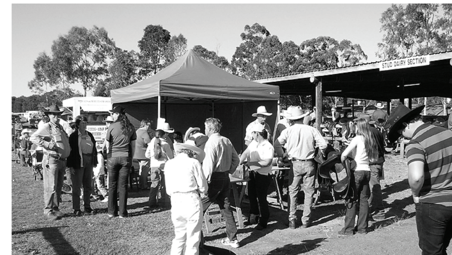
The Fraser Coast Horse Sale 2008, Maryborough Showgrounds, Maryborough